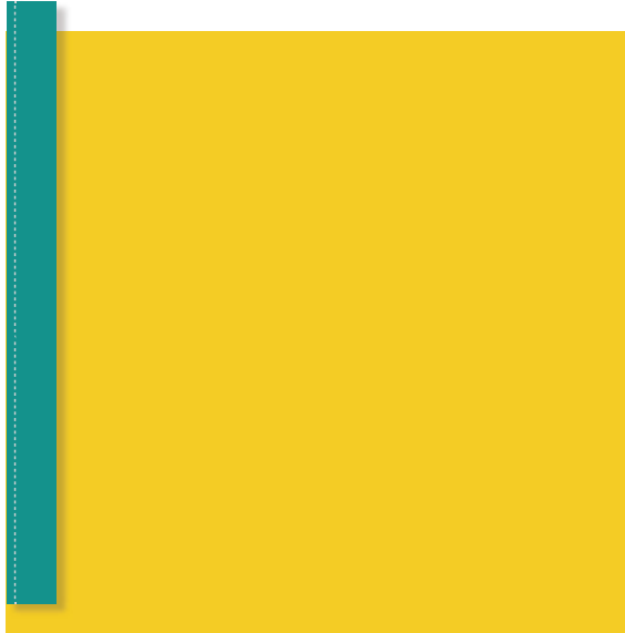
Back of Quilt

Attach flanged binding to back of quilt first